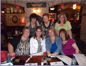
Lake Pointe & Rochester Conference attendees