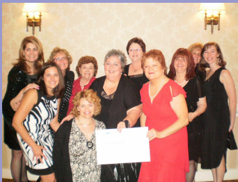
WCR Michigan Winners