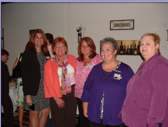
WCR Lake Pointe 2011 Line Officers