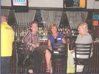
The ladies enjoying the WCR Lake Pointe Mixer