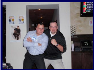
Yup... those are the Keith's Don't Ask...