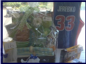
To sum it up... The golf outing auction was a huge success!